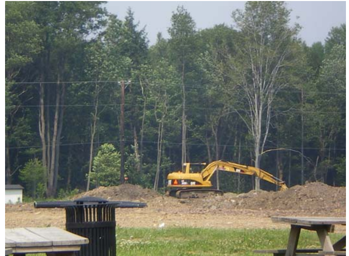
Leveling by the Little League Field by B & R