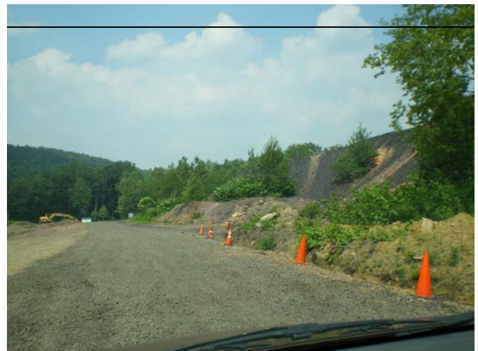
New road by the boney piles